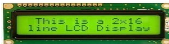
Fig no. 2 LCD Display